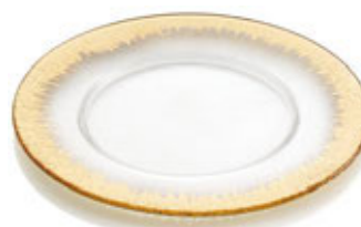
IVV Orizzonte Charger's Customized Decoration for the Westin Anaheim Hotel - California