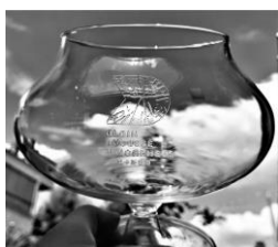
IVV Cognac Goblet Customized with Alain Ducasse Restaurant's Logo at the Morpheus Hotel – Macao

In addition to our standard range, the IVV's Hospitality Division is able to customize standard items and to design bespoke items, with great flexibility. According to your specific requirement, we identify the most suitable manufacturing technique: from the application of a logo/trademark to the engraving of motifs with sandblasting, serigraphy or laser techniques, up to the realization of exclusive models for shape, size and color. Large part of our hospitality's clients refer to IVV to develop customized decorations of chargers or glassware personalizations: